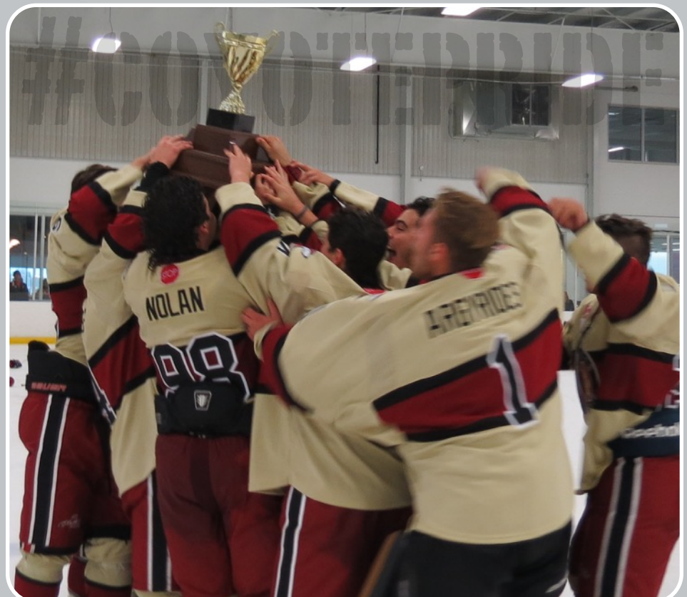
Midget Coyotes celebrate their Titans Tournament victory

The Midget Coyotes are headed up to Sudbury to participate in the Big Nickel Tournament November 6th to 8th before returning home to host ETA games on November 14th vs Barrie, November 22nd vs Ajax-Pickering, November 25th vs Barrie and November 28th vs Quinte.